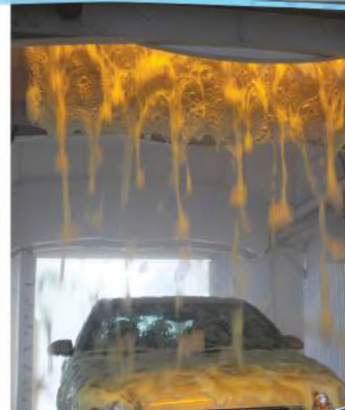
Foamy Wax Bath