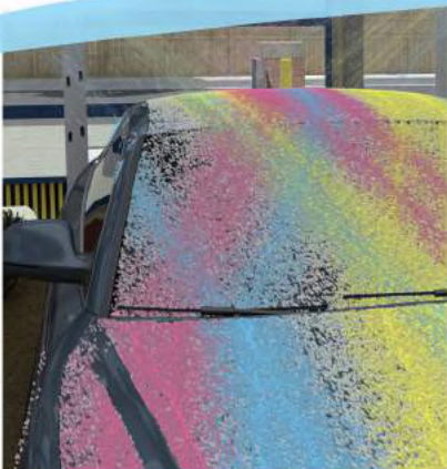
Triple Foam Shine