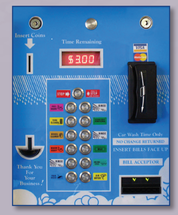
Push Button Bay Meter

It is also is completely computer-controlled so there's no need for costly manual operation or adjustments which can actually shorten the life span of your equipment.