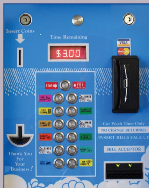
Push Button Bay Meter

It is also completely computer-controlled so there's no need for costly manual operation or adjustments which can actually shorten the life span of your equipment.